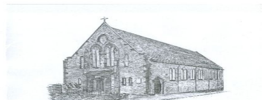
Sacred Heart, Colne